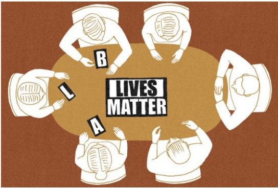
Illustration By James Steinberg for TIME