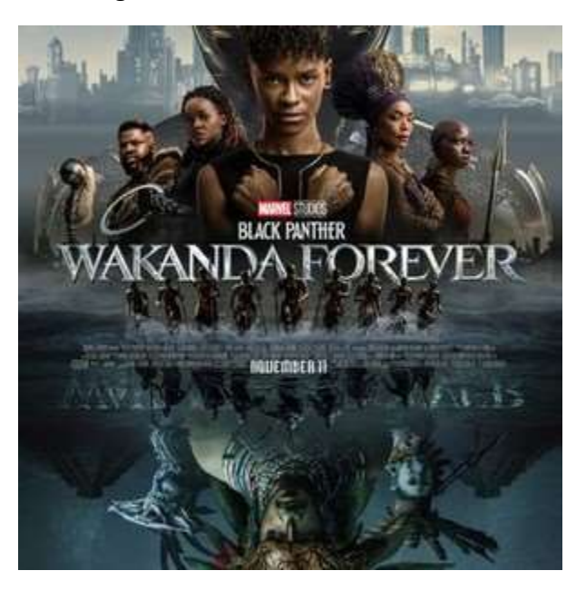
Black Women As Superheroes James Mulholland, 12/11/22